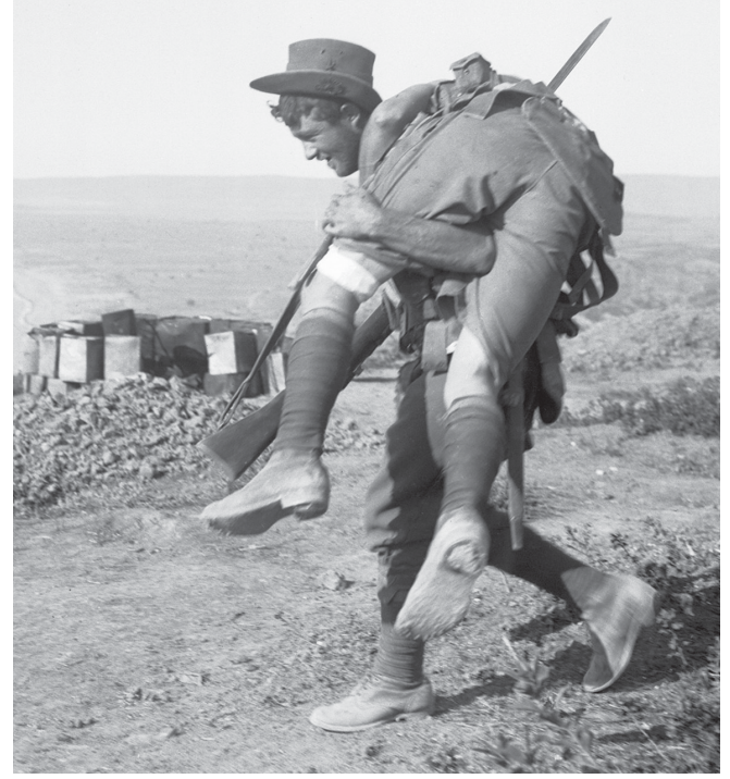
An ANZAC soldier carrying a wounded comrade at Gallipoli